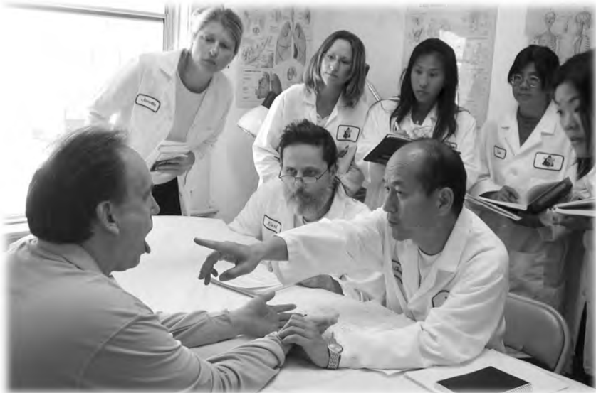
In the ACCHS teaching clinic, students watch carefully as the supervisor demonstrates tongue diagnosis procedures.