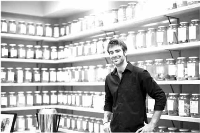
"Your fellow students and classmates help you through the program...and you end up making best friends with the people around you."

A student may elect to engage in part-time studies. In this case, a study plan will be designed to ensure that the program can be completed within the desired time period. For the Master of Science in Traditional Chinese Medicine degree to be awarded, students are required to complete all studies within eight years of initial matriculation.