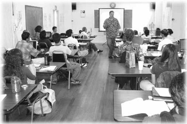
"Your fellow students and classmates help you through the program...and you end up making best friends with the people around you."

A student may elect to engage in part-time studies. In this case, a study plan will be designed to ensure that the program can be completed within the desired time period. For the Master of Science in Traditional Chinese Medicine degree to be awarded, students are required to complete all studies within eight years of initial matriculation.