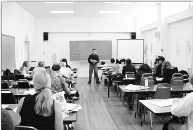
In the Herbal Formulas class, students learn to distinguish and understand the many effects of herb and herb formula treatment.