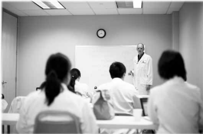
In the Clinical Theater class, students learn to distinguish and understand the many effects of acupuncture treatment.