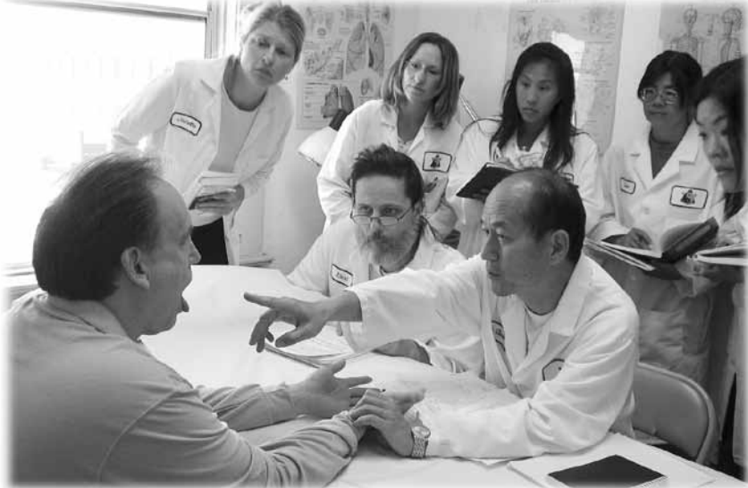
In the ACCHS teaching clinic, students watch carefully as the supervisor demonstrates tongue diagnosis procedures.